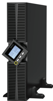
Display panel can be rotated